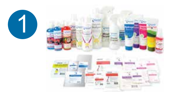
Advanced wound care products designed for nursing homes and made by Gentell

Gentell manufactures a complete line of advanced wound and skin care products which are available through insurance billing* and capitation programs. Our Clinical Team provides wound consultation and on-site training each month. We offer documentation support including Fastcare, the first integrated wound care solution that provides quality improvement (QAPI) reports, facility reports, and timely information to ensure government compliance and the optimal operation of your facilities. And our Wound Advisor reference guide includes wound management protocols to help with treatment planning.