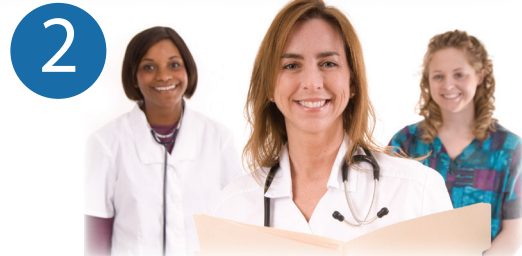
On-Site Clinical Consultants