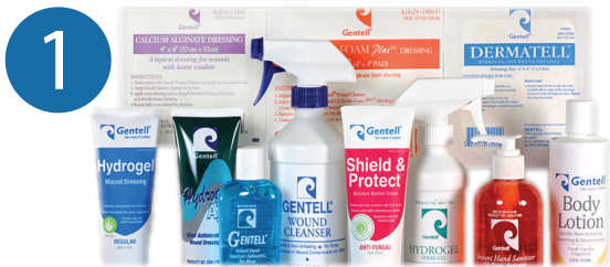
Advanced wound care products designed for nursing homes and made by Gentell